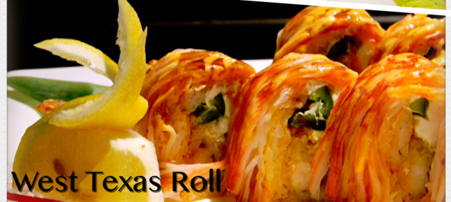
West Texas Roll

*18% Gratuity added for parties of 6 or more.