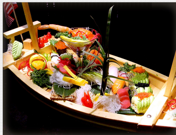
Sushi & Sashimi For Two