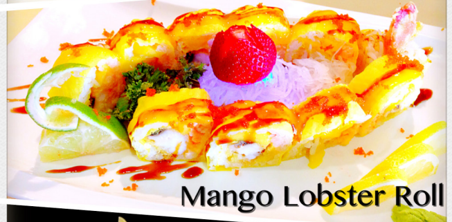
Mango Lobster Roll